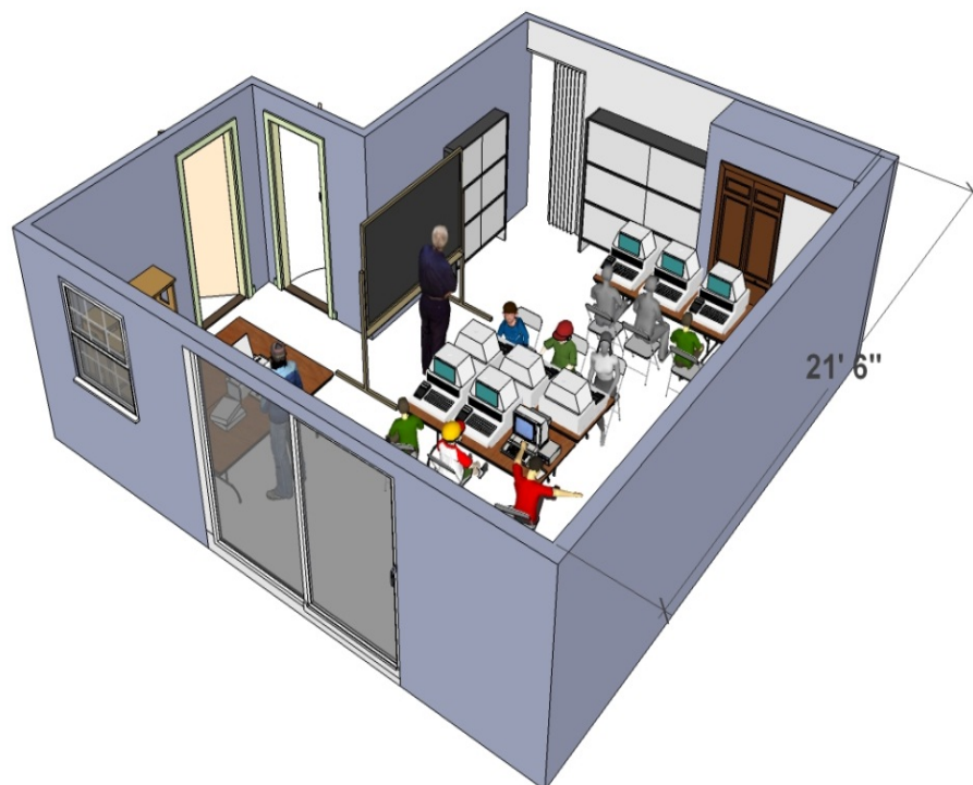
Figure 1: Computer classroom in the Friedman home.